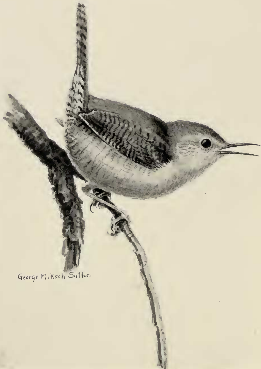
THE HOUSE WREN (Life Size)

It is impossible, from the meagre data at hand, to account for the absence of the well-night ubiquitous House Wren at Bethany during